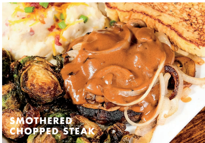
SMOTHERED CHOPPED STEAK

Mild, White Fish hand breaded & fried. Served with House-made Potato Chips & choice of 2 Side Items. 15